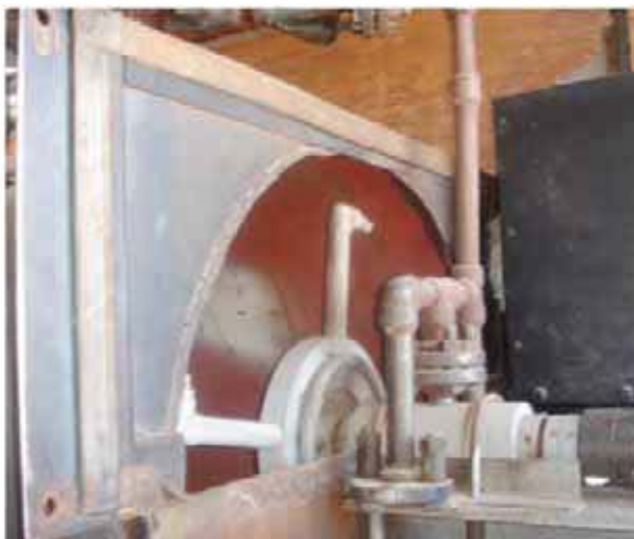
Runs at 17,000 RPM (Revolutions Per Minute) with 500 Horse Power weighing only 60 pounds and only two moving parts. Neldon Johnson stated, "It's the most efficient engine ever built"