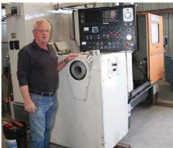
The turbine manufacturing machine can produce 100 turbines per day.

tanks to superheat the steam; it does not require water-cooled cooling towers to condense the steam; and it does not require the expensive and sophisticated monitoring devices for Balance of Plant due to the rugged durability of IAUS's proprietary turbine.