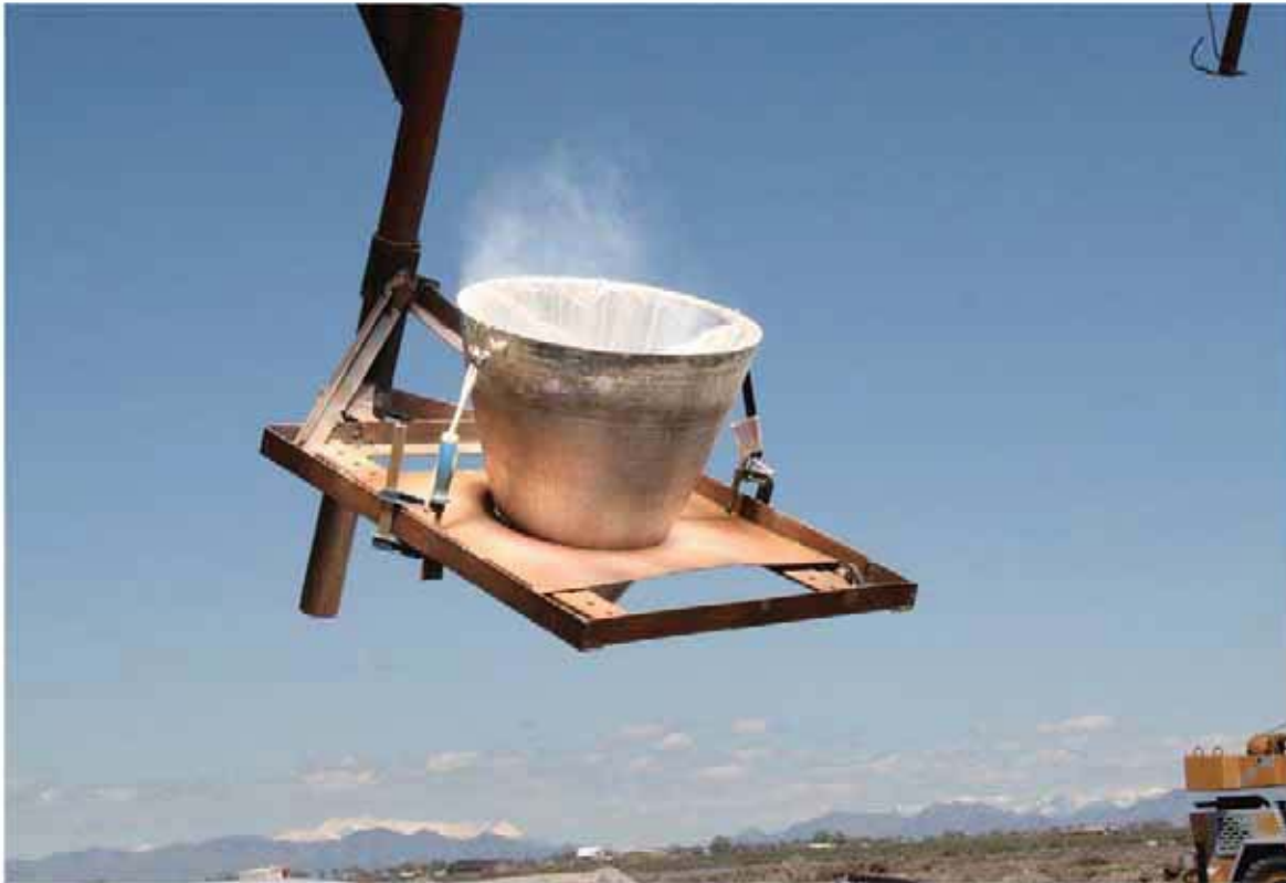
This photo shows a clear picture of the Concentrator and the emanating heat. The Concentrator is the key to making a zinc battery that is key in producing inexpensive 24/7 clean renewable energy. This is something no one else in the world is even close to doing. WE ARE!