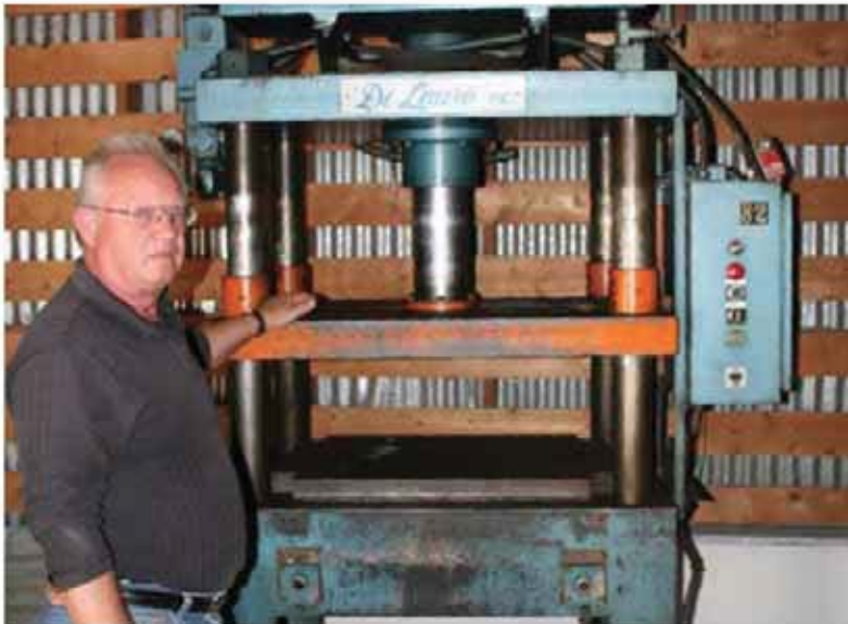
One of the presses at the manufacturing plant that mass-produces the concentrators.